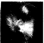
Healthy Child Age 3 Years

A comprehensive eye exam, including a thorough retinal exam, can detect early signs of numerous diseases that affect not only your eyes and your sight, but also your overall health. The Optomap Retinal Exam helps your doctor identify abnormalities that could indicate the onset of a number of diseases that often present first in the retina. In these instances, individuals typically do not experience any pain or outward symptoms.